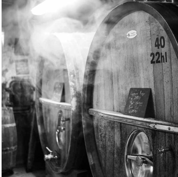
ORATOIRE ST MARTIN | LES P'TITS GARS