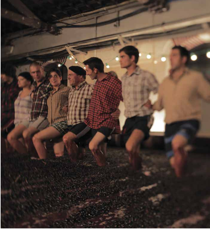
QUINTA DO NOVAL