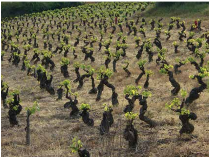
DOMINIO DE TARES

The somewhat lyrical Dominio de Tares say their wines are of 'great equilibrium' and 'cradled in noble woods.' Responsible for putting the once moribund region of Bierzo back on the map, they're just over a decade old, an infant in Spanish wine terms. However, they utilise ancient vineyards and painstakingly artisan-like practices to create expressions as pure and characterful as can be coaxing from the multiple microclimates in which they operate. With their fierce focus on improving vintage by vintage and harnessing of some of the best oenological minds in Spain, they are a winery to watch.