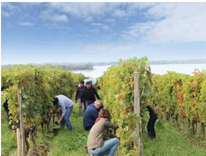
CHÂTEAU MARQUISAT LA PÉROUSE

Vegan is a pretty common term these days, so most of us are aware that the vegan diet accommodates no animal products whatsoever. The reason not all wines are vegan- or vegetarian-friendly is down to the way a wine is clarified – that is to say, made clear and bright – via a process known as ‘fining’. Young wines naturally contain proteins, tartrates, tannins and phenolics. These are in no way harmful, and most wines will eventually self-clarify. The main reason wines are fined in the first place is because we wine drinkers don’t generally like a glass of something that’s hazy or cloudy. To hasten the clarifying process, many winemakers use fining agents. The most common of these are casein (milk protein), albumen (egg white), gelatin (animal protein) and isinglass (fish bladder protein). Some winemakers are now opting for animal-friendly alternatives such as carbon, bentonite clay, limestone, kaolin clay, plant casein or silica gel. For those who are interested, labels are increasingly becoming more specific about the fining and filtering agents used. And then there are those who undertake no fining at all and offer their wines unfiltered.