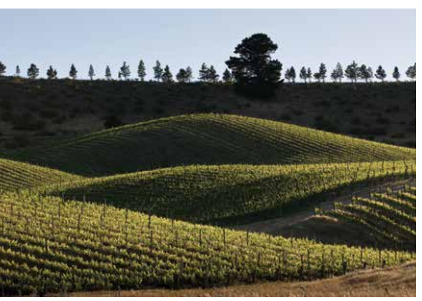
CHARD FARM'S MASON VINEYARD