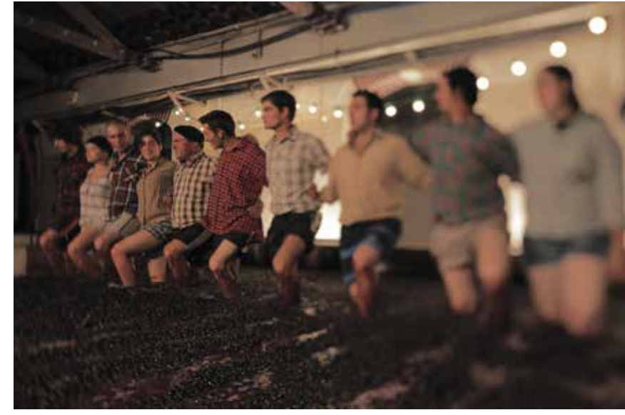
QUINTA DO NOVAL

750ML $69.99 750ML $69.99 1L $84.99 $365.00