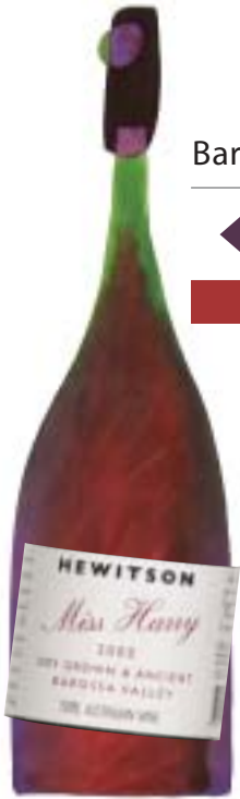
Hewitson Miss Harry Barossa Valley Grenache Shiraz Mourvèdre 2005