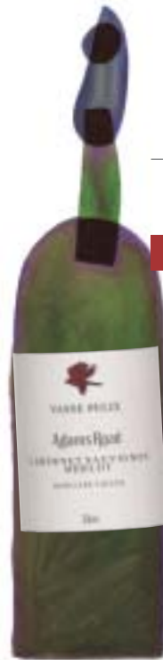
Vasse Felix Adams Road Cabernet Merlot 2004